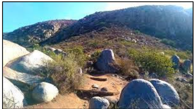
Trail to Fortuna Peak

CARPOOL: We'll be starting early, but parking space will fill up quickly. Consider carpooling. I will provide my truck (black Toyota Tundra) with three (maybe 4) seats from Fashion Valley Mall Transit Center parking area nearest Fashion Valley Rd (west end of the mall) from 6:20 to 6:35 am. Be prepared to drive if space fills up. Parking at the Transit Center parking lot is free for 24 hrs and is occasionally patrolled by security. That being said, the same risks apply there as to regular street parking. Donations for gas are welcome, but not required.