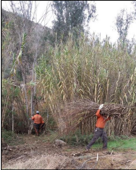
Rancho Santa Fe workers cutting and hauling tamarisk.

area (primarily our county) and to learn how to know these plants. Thus, the basic training will go beyond simply memorizing names and will encompass the four components of taxonomy: description, identification, nomenclature, and classification. The class is NC 0301, and runs from Jan 26 - May 11, 2019. Visit this website for more info about the class: