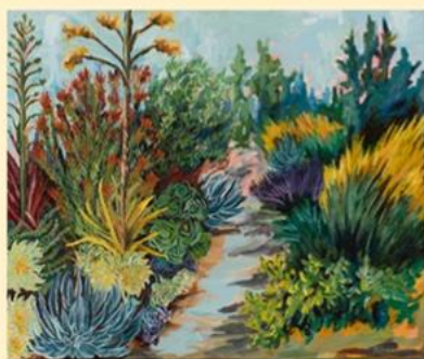
“Bringing Nature Back Home Pt. 1” by Molly Paulick

Seeking Artists for the CNPS San Diego 2020 Native Garden Tour April 4th & 5 th