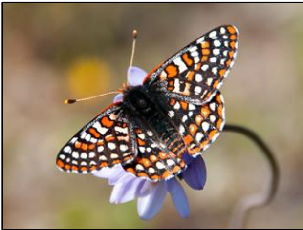
Quino Checkerspot

Habitat: Open margins of scrub where dominant plant species include California sagebrush ( Artemisia californica ), chamise ( Adenostoma fasciculatum ), and non-native/native grasslands.