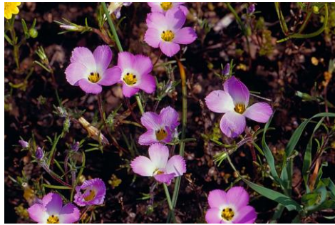
Fringed linanthus ( Linanthus dianthiflorus ).