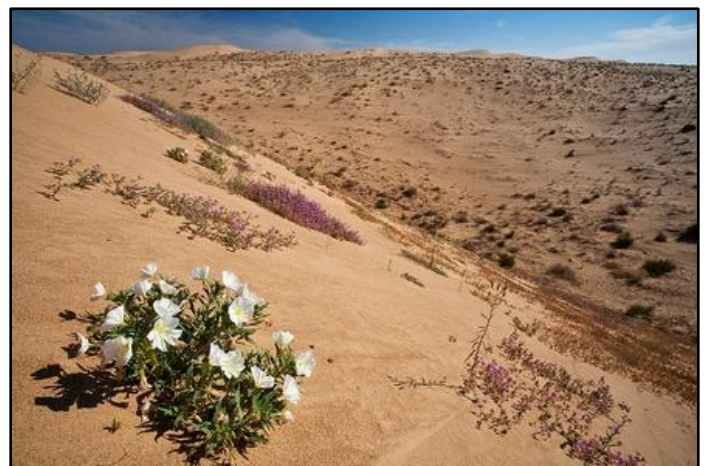
Algodones Dunes Wilderness Area.