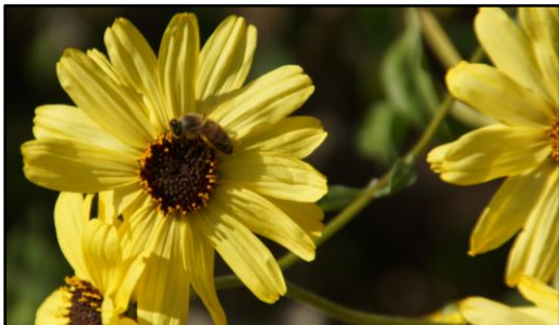
California Encelia ( Encelia californica ) and bee in a tour garden.

Come see over 18 Native Plant Gardens in the Historic Seaside Neighborhood of Downtown Oceanside! Plant experts and neighborhood locals will lead a 1.5-mile walking tour to see these wonderful front yard gardens. Meet at 2 pm, Sunday, March 29 in the St. Mary School parking lot at 515 Wisconsin Ave. The guided walk is free. Kids will be selling lemonade and cookies along the route. St. Mary School is one block east of the 101 Cafe near Coast Highway and Wisconsin St. The Oceanside Coastal Neighborhood Association and Buena Vista Audubon Society sponsor our 2020, 18th Annual Tour. More info is at: 760-439-2473, https://BVAudubon.org , or https://OCNA101.org .