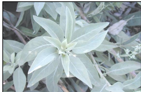
White Sage ( Salvia apiana ).

You'll be creating a more resilient future. You'll be Saging the World.