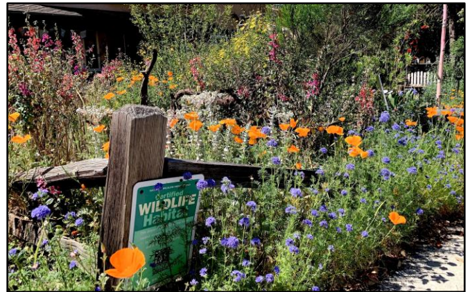
A California native plant garden.

The 27th Annual SERCAL conference will be held at Palo Corona Regional Park & Discovery Center in Carmel Valley (Monterey) . The annual conference provides a congenial environment for professionals, students, and enthusiasts to invigorate their work through technical presentations, poster presentations, fieldtrips, and sponsorships.