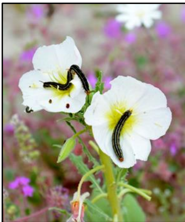
(left) White-lined sphinx moth larvae were also quite common on the Evening primroses ( Oenothera deltoides ). They are large black and red caterpillars with smooth skin and a red spine.

A breeze was blowing and the sky created a subdued tone as it was nearly entirely covered with alto cirrus ice crystal clouds, except for openings to the south where light shone through the clouds. Past the Clark Lake, the slopes still had coverage of sand verbena with a few Desert sunflowers ( Geraea canescens ; above) but it was possibly a bit past the sand verbena’s prime already. I walked out on to the hill north of the road and down a draw. Painted Lady butterflies flew when I walked near. The temperature was too cool and the wind just a bit strong for them to be flying but they leapt up from the ground as I approached them. It is well known that Painted lady butterfly explosions result from early rain in central and southern Baja California, that tropical rain mentioned earlier, which provides an early start for the native host plants. As the populations of larvae swell and then pupate, adult butterflies begin a leapfrog northward migration where they reproduce along the way.