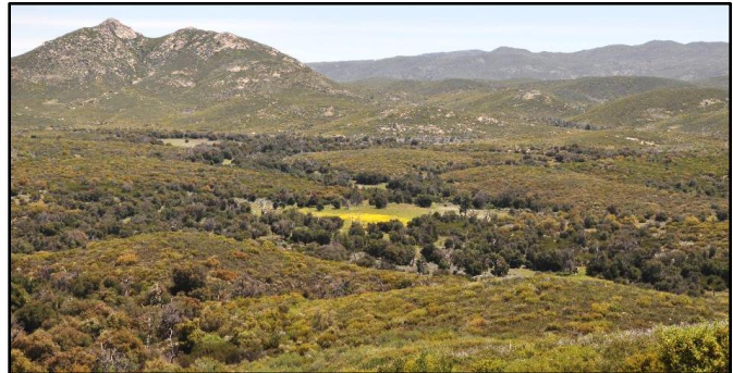
Quercus agrifolia , Q. acutidens , Arctostaphylos glauca , Adenostoma fasciculatum and Lasthenia sp. at Corte Madera.

Of course, where a drainage flows through a valley or the soil is deep enough and precipitation great enough, the pattern of chaparral touching a line or patch of Quercus agrifolia (Coast live oak), creates a visual design that portrays the diversity and variability of the vegetation contrasts.