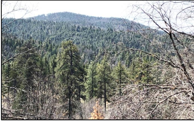
Pinus jeffreyi in the Laguna Mountains

Mendenhall Valley on Palomar Mountain from the road to the observatory presents a forest of deciduous and evergreen oaks, as well as Jeffrey pines and White firs, a full, rich texture of trees.