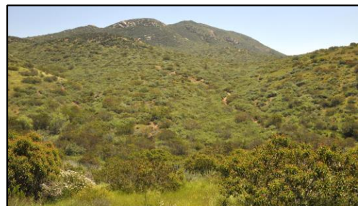
Salvia mellifera & Malosma laurina at Mission Trails

During dry periods, this vegetation loses many of its leaves. Artemisia californica (California sage brush) becomes gray-brown due to shriveled up leaves, and Eriogonum fasciculatum (California buckwheat) may have reddish leaves. Rhus integrifolia (Lemonade berry) remains green all year. Often a part of Coastal Sage Scrub, Salvia mellifera (Black sage), with its drought deciduous leaves, may appear gray and dead when the weather is extremely dry.