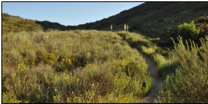
Artemisia californica & Bahiopsis laciniata at McGinty Mtn

On slopes a bit further inland, another shrub that has a dull green color in spring and turns brown in summer is Bahiopsis laciniata (San Diego sunflower). Bahiopsis laciniata has bright yellow flowers with yellow centers. It grows on south facing slopes along I-15 through Murphy Canyon. Prior to the 1980s, it also covered the south slope along I-8, west of Adobe Falls, near the College Avenue off ramp. However, since then, Cenchrus setacea (Fountain grass) spread into the Bahiopsis laciniata gradually taking it over and replacing it, even in the absence of fire or other disturbances. Only patches of Bahiopsis laciniata remain where once the entire slope was covered with it.