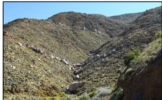
Desert transition zone

Farther east in the desert, the pattern of the vegetation becomes overshadowed by the dryness. With 6 inches of rainfall or less each season, the rocky slopes behind the vegetation become more prominent than the vegetation itself. However, in the chaparral transition zones and juniper woodland areas, the vegetation may create a pattern depending on the slope aspect with the north slopes more heavily vegetated than the south slopes. Junipers can grow as small trees or large shrubs in those areas.