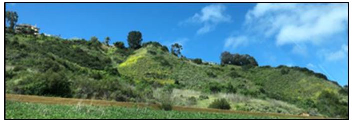
Coastal Sage Scrub in Rose Canyon west of I-5

One of the most distinctive vegetation communities in terms of color, texture and patterns is pure Coastal Sage Scrub, Diegan Coastal Sage Scrub, or Artemisia californica , Eriogonum fasciculatum , Rhus integrifolia vegetation.