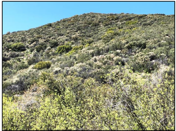
Ceanothus perplexans at Buckman Springs

Ceanothus perplexans (Cup-leaf lilac), a shrub with a warm, creamy scent while in flower.