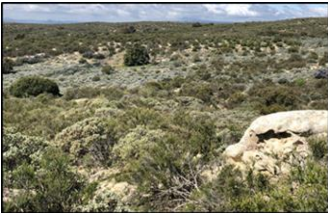
Buckman Springs, La Posta Road, and Live Oak Springs are areas where this color phenomenon is visible (above).

The southern part of the County supports a varied and complex pattern of Mixed Chaparral. In the Japatul area, vigorous Mixed Chaparral combines the Ceanothus and Arctostaphylos with the scrub oak and chamise to create a strong and tall growing chaparral. Along I-8, near the turnoff for the Sunrise Highway, Adenostoma sparsifolium (Red shank) is dominant and creates a texture that is more fluffy and soft appearing than other Mixed Chaparral, and the color is a little lighter green with some yellow and brown background. In these southern areas, a number of valleys and mesas exist where the chaparral grows down to the edge of the valley or other flatter terrain, and the silver leaved Artemisia tridentata (Great Basin sagebrush) fills in the lower areas. The contrast in color between the chaparral and the sagebrush is striking.