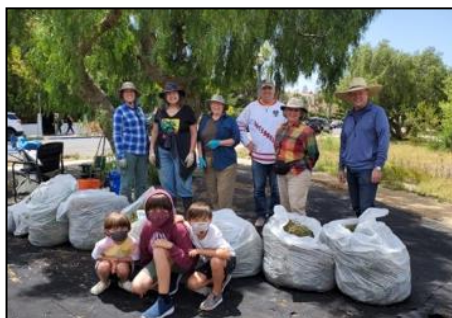
Above: Bird Park Workgroup.

While we are waiting on Balboa Park approval for the Bird Park Adopt-A-Plot Landscape Design plans, our very productive volunteer members met at Bird Park on 4 different Saturdays to remove invasive weeds in the wing section. We had a great time reconnecting with fellow old and new NGC members. The plots look 100% better and the existing native shrubs and trees are thriving. The rest of the plots in the wing section are heavily infested with weeds and the local community is interested in working on them. If you are interested in working on this public garden, please sign up here . Novice to experienced native gardeners are welcome!