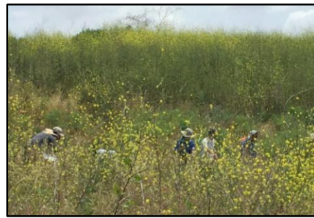
Above: Searching among the dried grasses and wild mustard. Right: Threadleaf brodiaea scape.

thick mustard and non-native grass patches, eking out an existence competing with non-native annuals atop. Our 2019 count resulted in about 1,300+ scapes (inflorescence stalks or