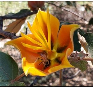
Left: Flannel Bush Flower ( Fremontodendron californicum ), California Botanical Garden.

Established natives require deep watering once a month and overhead sprinkling to wash off dusty leaves. Remember to water in the cool hours of the day and overhead water in the late afternoon. Some natives, like Flannel Bush ( Fremontodendron californicum ), can't tolerate any summer water. Calscape is a great resource look up water requirements for your native garden.