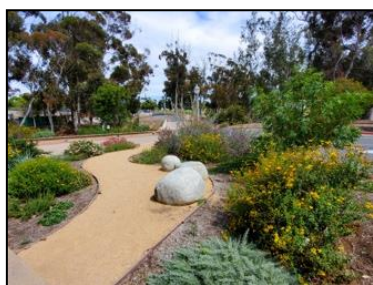
Left: CNPS-SD Adopt-A-Plot at Zoro Canyon in Balboa Park.

Did you know that the NGC has another Adopt-A-Plot garden at Balboa Park? The native gardens were designed by NGC