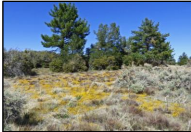
( Lasthenia sp.) and company.

then had climbed to 81°F/27°C, we decided to turn around without continuing on to Cactus Spring and stopped instead for a while on SR-371 during our drive back, to enjoy the goldfields