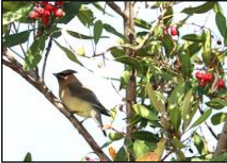
Cedar Waxwing ( Bombycilla cedrorum ) on a Toyon branch ( Heteromeles arbutifolia ).

Let's start with Toyon, or Heteromeles arbutifolia , a great foundational evergreen. My first memory of Toyon was talking with Greg Rubin, who said that putting a Toyon in your yard is like having an "aviary on a stick," and boy was he right! Flocks of Cedar Waxwings descend on these shrubs and clean out the berries – they are such a beautiful and sleek bird. We've enjoyed seeing a wide variety of birds use this plant for food and cover.