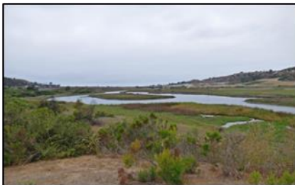
Left: Tern Point