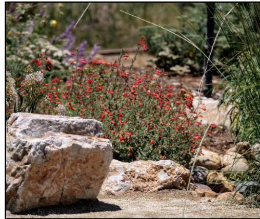
Bird Park Blooms.

A huge thanks goes to our wonderful Bird Park Volunteers and all the work that they do! If you are interested in volunteering for Bird Park, sign up at this link: Bird Park Workgroup