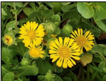
Suisun gumplant ( Grindelia x paludosa )

The NGC potluck meeting will follow beginning at 5:30 pm outdoors at the home of Holly McMillan in Point Loma. Bring a dish to share and catch up with members. Members are also welcome to bring native plants to exchange.