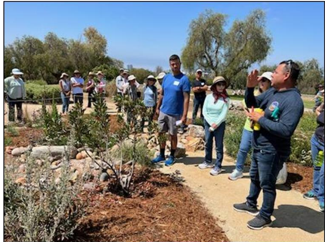
Photos of the Bird Park meeting/brunch