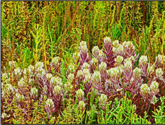
The Red Sand Verbenas covering most of the dunes bore flowers as well as fruit ( Abronia maritima ),

but it was clear enough to see the distant salt marsh bird's beak ( Chloropyron maritimum [below]).