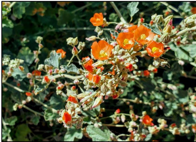
Desert Mallow ( Sphaeralcea ambigua)

Please RSVP at this link: August GC Meeting