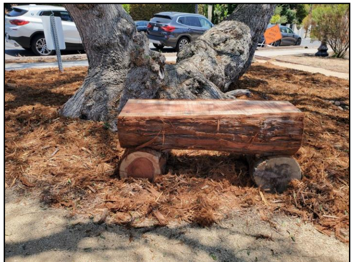
New Bird Park Redwood Bench.