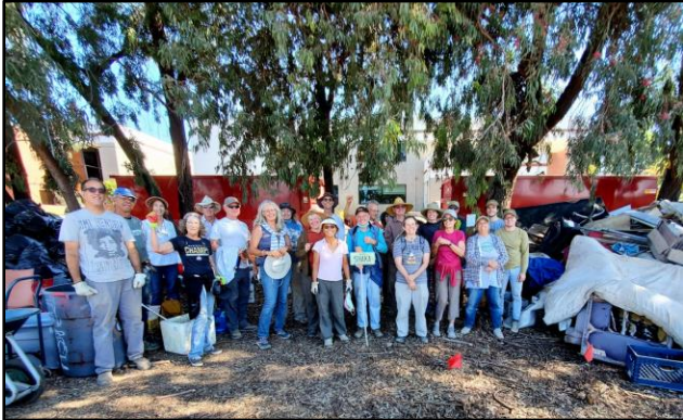
Thank you to everyone who helped!!!