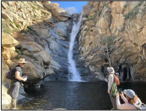
Cedar Creek Falls in January.

The light rising over the leafless riparian area in the bottom of a green, sloped, deep canyon (below) was striking.