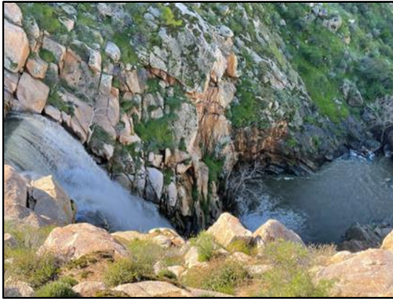
Cedar Creek Falls from above.