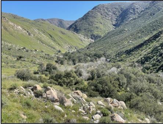
Cedar Creek valley above the falls.

The way back was similar as before but even more of the wildflowers were now showing with patches of Eschscholzia californica and Lupinus hirsutissimus . The sound of the roaring San Diego River was as loud as ever and the riparian trees were beginning to put out leaves.