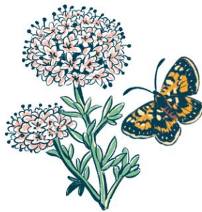
Artwork by Carly Lake

In spring, the dainty pink and white flowers of the California buckwheat start to bloom — just what the adult Behr's metalmark is looking for. The frilly dense flower clusters are the perfect perch for a nectar meal. Like the buckwheat, Behr's is a striking and easily recognizable butterfly. You can tell you're looking at