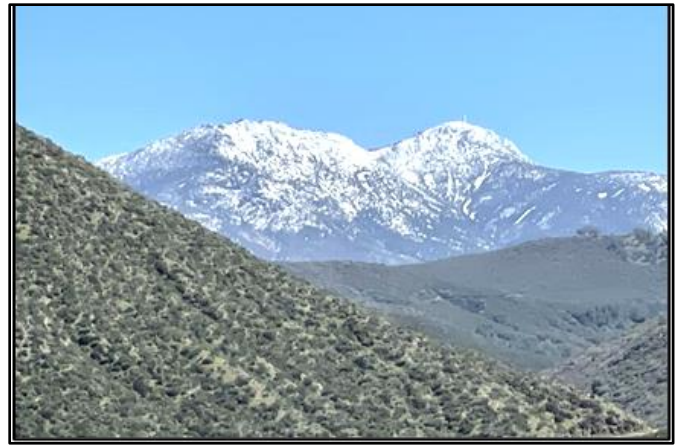
Snow on Cuyamaca Mountain.

I mentioned in an earlier article that two weeks in January 2023 was a period of amazingly great rainfall in San Diego County, with 20 inches on Palomar Mountain and 18 inches at Cuyamaca Lake.