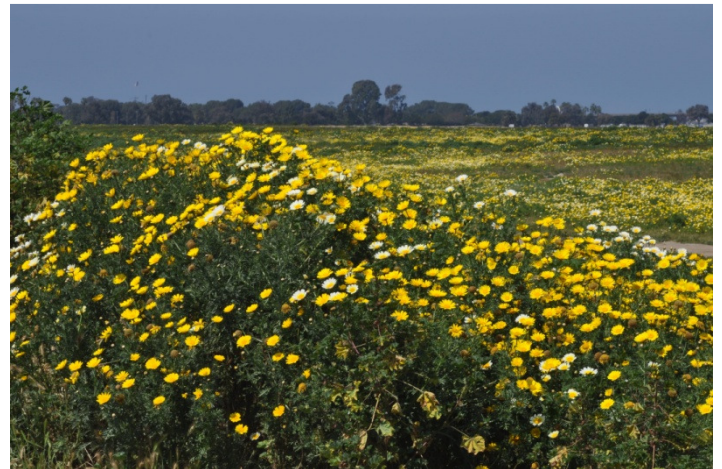
Glebionis coronarium at Fiesta Island.

The genus Chrysanthemum consists of about 30 species native to Asia and Europe as it is currently configured. (Scientists sometimes reassess the genetic and taxonomic relationships for species so that occasionally the groupings of species within a genus as well as scientific names change.) The genus Glebionis was established from within the genus Chrysanthemum to distinguish this small group of species from ornamental species. There have also been innumerable cultivars of the ornamental species including many that create pom-pom like flowers that bear little resemblance to their ancestors. Anyone