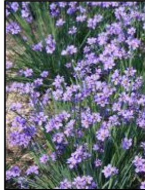
Blue-eyed grass ( Sisyrinchium bellum )

For more details about walks and activities at San Elijo Lagoon, visit http://sanelijo.org .