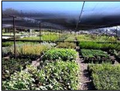
Photos of Tree of Life Nursery

For more information, visit Tree of Life Nursery at www.californianativeplants.com or call 949-728-0685, or visit the CNPS San Diego chapter website at www.cnpsd.org .