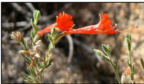
California fuchsia ( Epilobium canum ) at Rattlesnake Canyon, Poway.

https://picasaweb.google.com/102448857620437769245/RattlesnakeCanyonApril2013?authuser=0&authkey=Gv1sRgCK756I21st3cSQ&feat=directlink