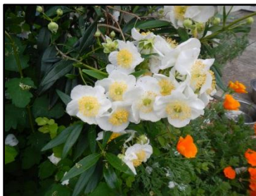
Photos from the 2012 Garden Tour

For more information, visit http://gardennative.org/tour or see the enclosed flyer. Hope to see you there!