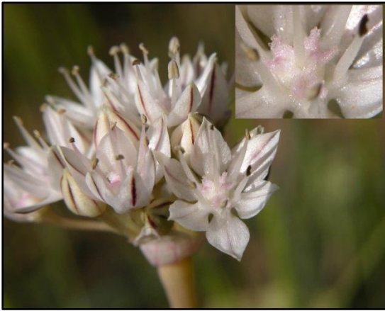
Yucaipa onion, with inset photo of ovary crests.

Diego County and even annotated a few from Riverside County. Once again, this reminds us of the value of voucher specimens over merely noting a presence.