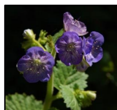
Phacelia spp. at the 2014 Garden Native Tour.