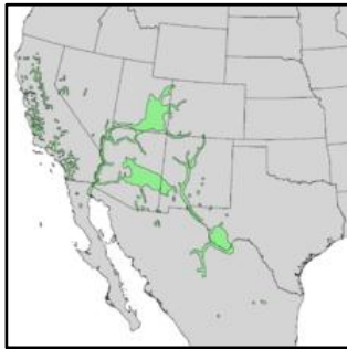
Populus fremontii range map. (map from en.wikipedia.org)

The overall range of Populus fremontii is from Texas, New Mexico, Nevada, Utah, Arizona and California, as well as northern Mexico. It occurs throughout California (Taylor 2000).