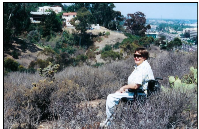
Photo from the rim of Dove Canyon, Hillcrest. March 2002.